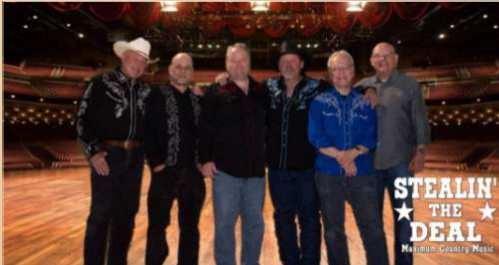
Country Music Featuring Stealin' the Deal