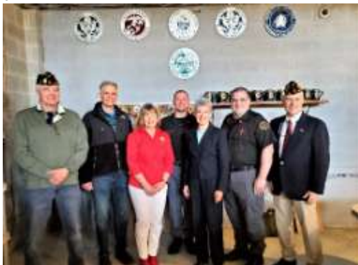
RWR Committee Mbrs with Sponsors RWR Wrap-Up Event Attendees at G34.3 Brewery