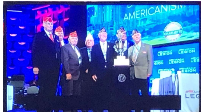
Past Department of Virginia Commanders accepting the National Americanism Trophy. This is the second year in a role Virginia has won this award. Attending Virginia Legionnaires signed our state marker.