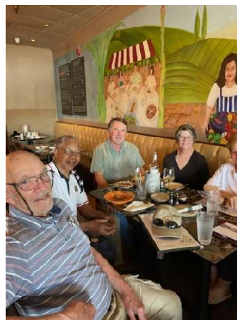
Attendees at the Post's April social gathering

Post Social Hour – Post 1995 invited all Legionnaires and their ladies on May 2 nd , to a no-host social hour at Rosemary's Thyme Bistro at the Colonnade Shopping Center in Centreville. This was our third social hour event and because the Bistro is a full-service restaurant, we encouraged Legionnaires to bring their dates and make an evening of it. The gathering commenced at 4 PM and wrapped up at 7 PM. Rosemary's Thyme is a Mediterranean themed restaurant and offered us a full menu of Turkish, Italian, and Greek foods from handmade pizzas, through small plates to full entrees. Each time we have a social hour the gathering grows a little bit larger. Our next social will be in August.